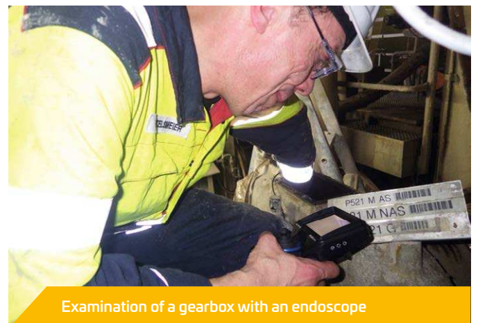
Examination of a gearbox with an endoscope

As this service job was planned and the special sealing and bearings were ordered based on the previous inspection, the repair time and the resulting dockyard costs were reduced to a minimum.