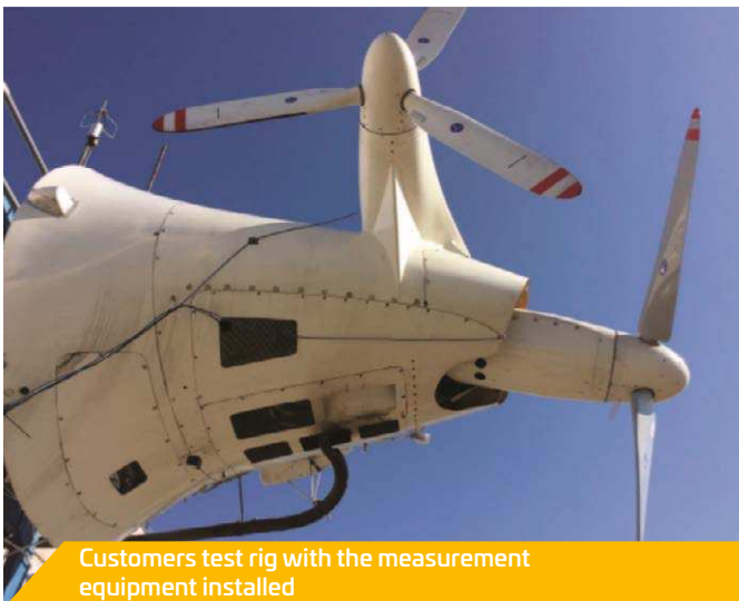
Customers test rig with the measurement equipment installed

The analysis of the data demonstrated that no resonances in the operating points occurred, so they could not be the root cause of the problems. Further investigation of the data showed that two of the three investigated shafts had peak loads caused by the driving motor. The customer was advised to take measures to eliminate the influence of the driving motor. These measures could be performed by OHP Services too.