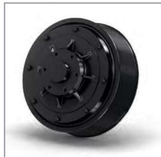
Series 270 (80 – 150HP)