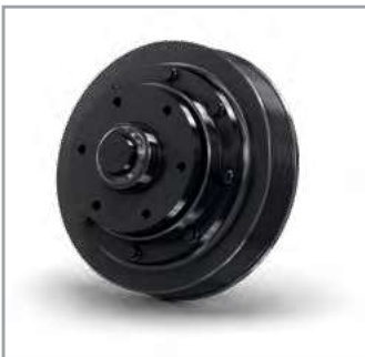
Series 125 (10 – 40HP)