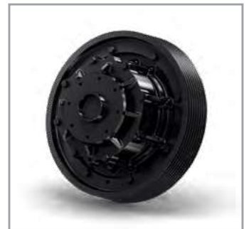
Series 370 (150 – 300HP)