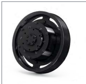
Series 170 – 200 (20 – 90HP)