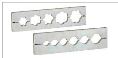
Clamping profiles adapted to the respective shape

Damage to the surface of the profiles is avoided