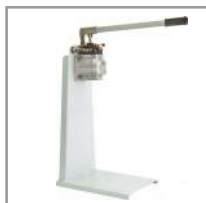
Manually operated hydraulic pump

Damage to the surface of the profiles is avoided